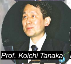
Prof. Koichi Tanaka