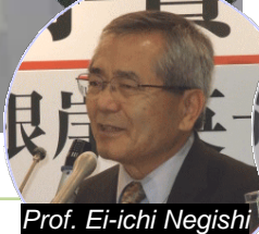
Prof. Ei-ichi Negishi