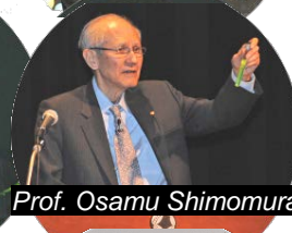
Prof. Osamu Shimomura