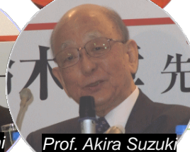
Prof. Akira Suzuki